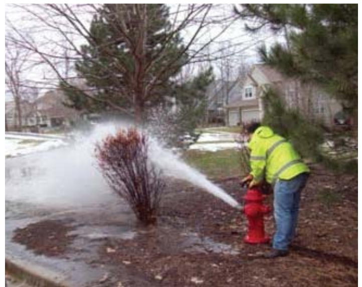
Fire hydrant flushing by City of Crystal Lake Water Division

Normally, no. As long as a hydrant is off, water should not gush out if struck. All the fire hydrants you see around the City are "dry barrel hydrants." This means there is no water sitting in the upper portion of the hydrant when it is turned off. The valve controlling the flow of water is actually below ground and there is a long stem connecting the valve to the operating nut. Near the base of that valve are weep holes. When the operating nut is used to turn the hydrant off, it opens those weep holes and allows the water to drain out of the hydrant and the stem. Incidentally, this is also a very important mechanism to avoid water freezing in the hydrant during the colder months.