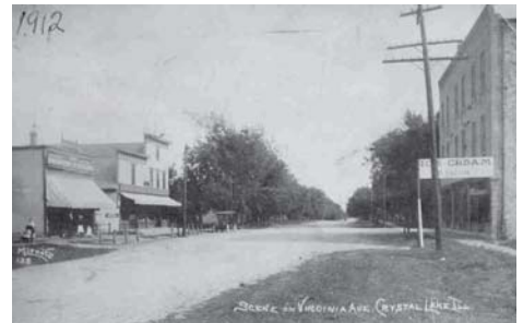
This scene is Route 14 looking east from Dole Avenue. Pierson's 3-story Brick Block Building is on right.

Fitch and was known as the "Brick Block Building" or "Fitch's Block." In 1924, the vacant and neglected brick block building was torn down. In its place, a gasoline station was erected by J.H. Bauer & Sons. Today, the corner is home to a Mobil gas station/car wash.