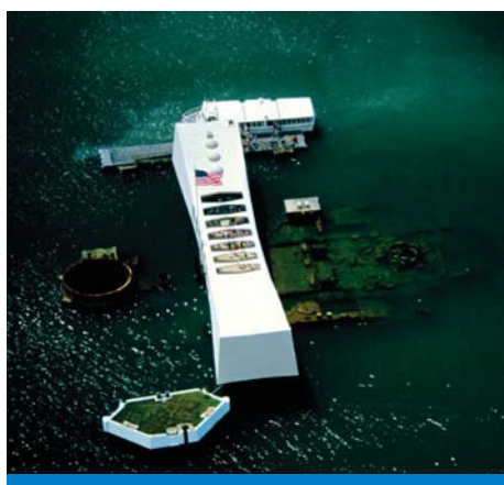
-USS Arizona Memorial Pearl Harbor, HI

Please take a moment to remember the thousands of U.S. Service members and civilians who perished on December 7th, 1941 in Pearl Harbor, Hawaii. The Crystal Lake Police Department wishes to thank each and every World War II Veteran and their families in the community.