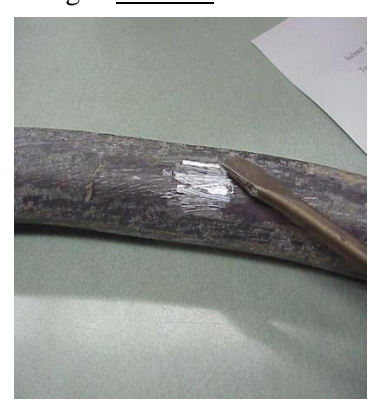
<u>Lead Service Line:</u> Silver/dull gray color and a magnet_will not stick to it.