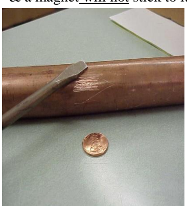
<u>Copper Service Line:</u> Copper color like a penny & a magnet <u>will not</u> stick to it.