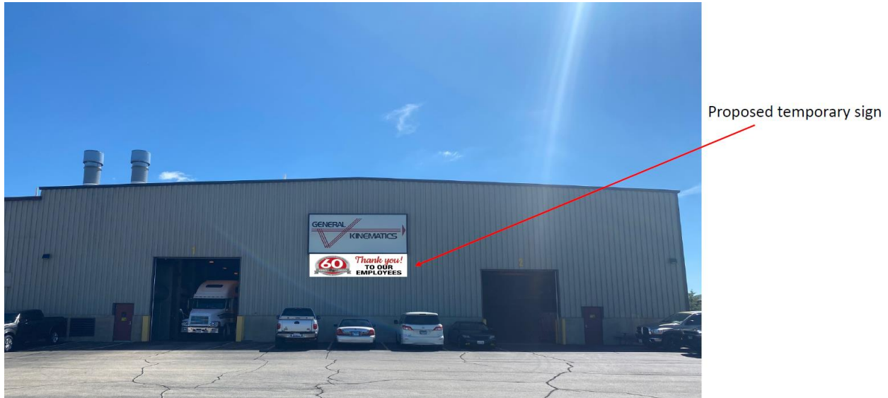
Image of proposed limited duration sign under the existing wall sign: