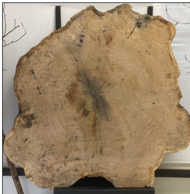
Slice of Wood