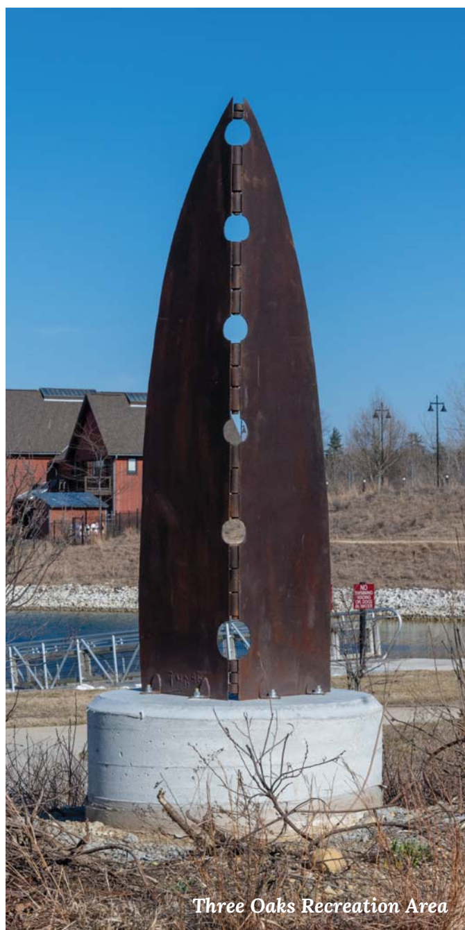
Three Oaks Recreation Area