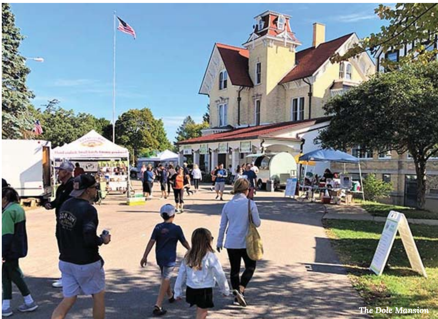
The Dole Mansion