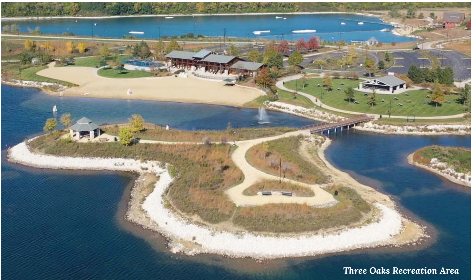
Three Oaks Recreation Area

The goals and strategies are outlined herein to provide a common guideline for decision-making.