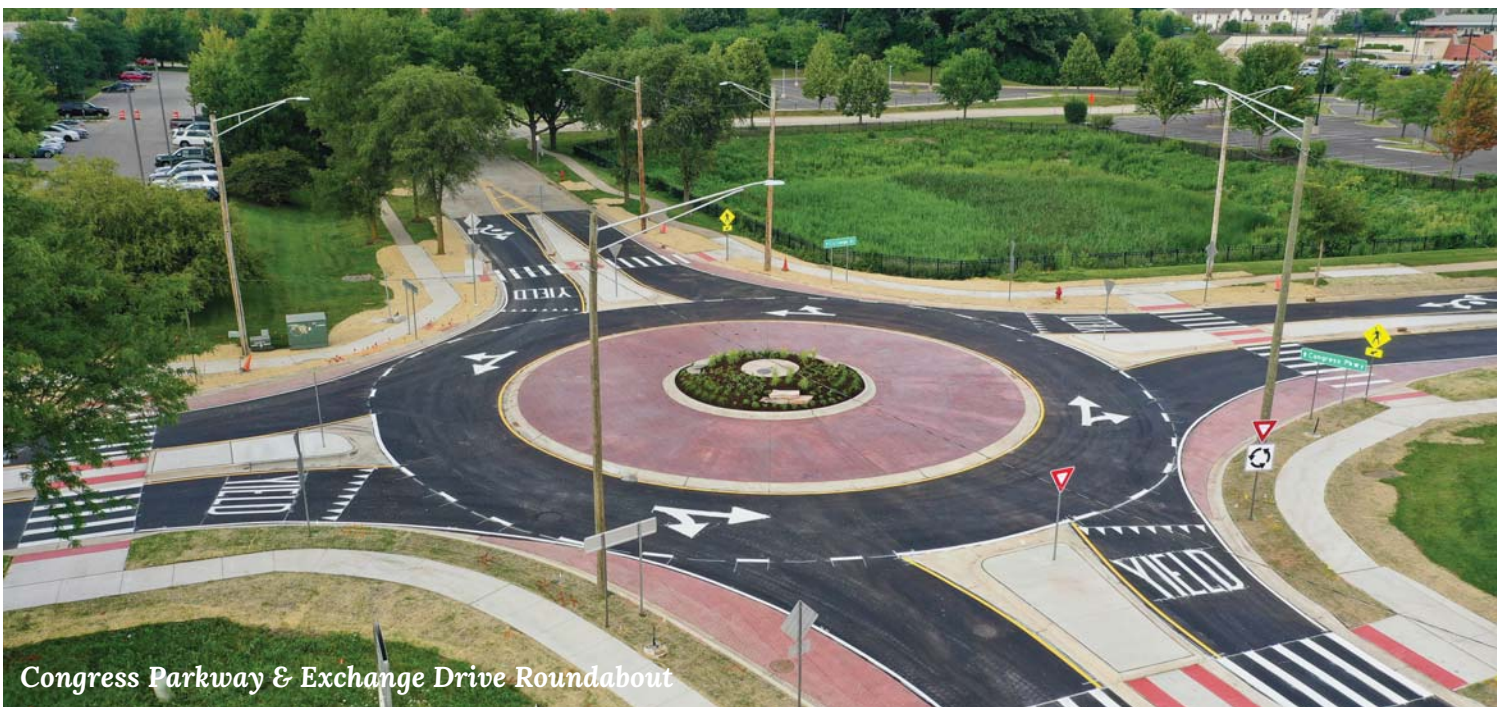
Congress Parkway & Exchange Drive Roundabout

A majority vote of the Commission is required to approve an art piece or art location for City Council's review.