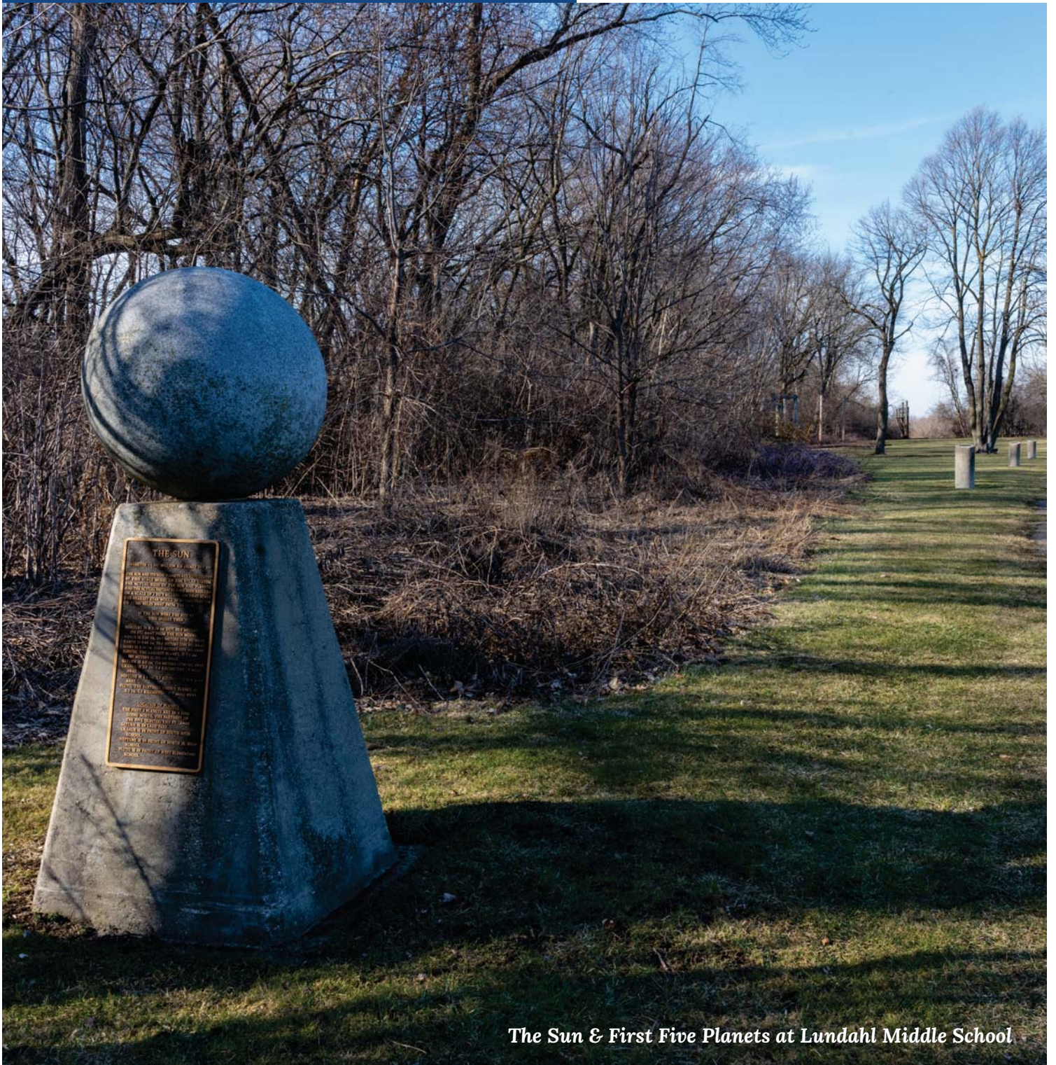
The Sun & First Five Planets at Lundahl Middle School