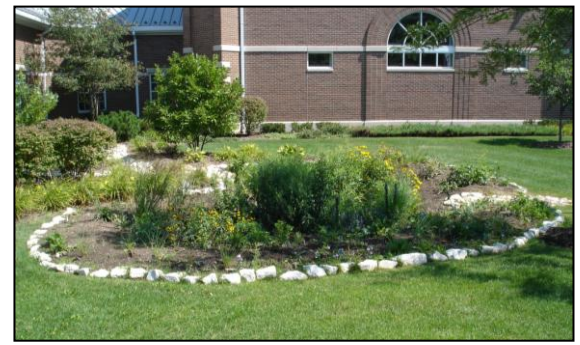
Rain garden installed to catch run-off and increase filtration at the Municipal Complex

The City of Crystal Lake works in conjunction with the McHenry County Water Resources Division to protect McHenry County's groundwater. For more information, visit their website: